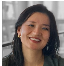
Kunji Sedo Parnetic Search Recruiting